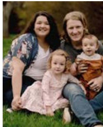
The Yates Family